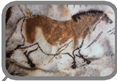
Cave Paintings (30,000 BC)