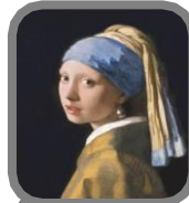
Vermeer (1665) Girl with a Pearl Earring