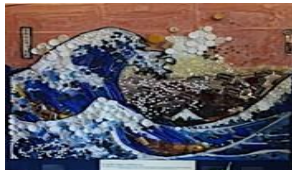
Pupils will create a collage of a landscape in the style of Jane Perkins.