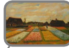
Vincent van Gogh (1883) Bulb Fields