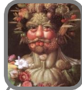
Arcimboldo (1591) Vertumnus