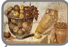
Citrus Fruit (63-79 BC)