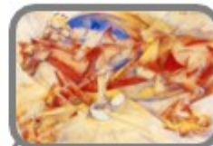
Carlo Carra (1913) The Red Horseman