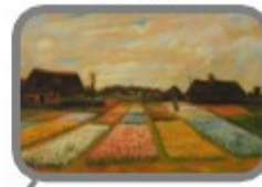
Vincent van Gogh (1883) Bulb Fields