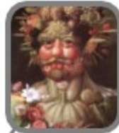
Arcimboldo (1591) Vertumnus