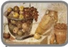
Citrus Fruit (63-79 BC)