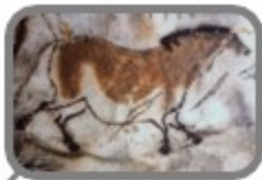
Cave Paintings (30,000 BC)