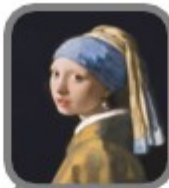
Vermeer (1665) Girl with a Pearl Earring