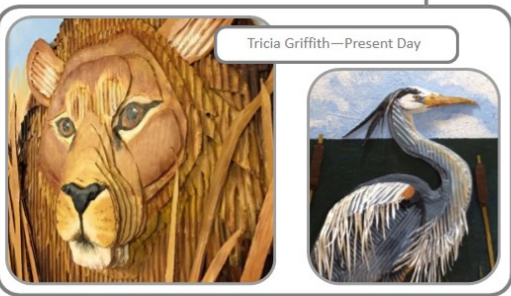
Tricia Griffiths—Present Day