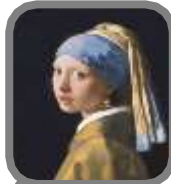
Vermeer (1665) Girl with a Pearl Earring