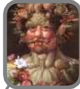
Arcimboldo (1591) Vertumnus