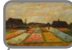
Vincent van Gogh (1883) Bulb Fields