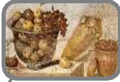
Citrus Fruit (63-79 BC)