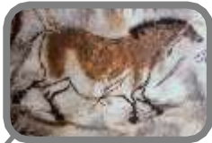
Cave Paintings (30,000 BC)