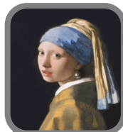
Girl with a Pearl Earring