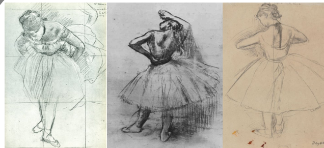
Edgar Degas 1872