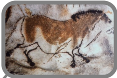
Cave Paintings (30,000 BC)