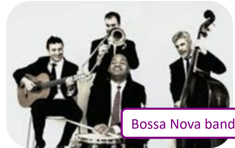
Bossa Nova band

Heritage: the traditions, achievements, and beliefs that are part of the history of a group of people.