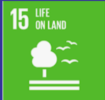
Biomes on land